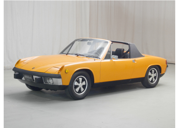
Image is general in nature and may not reflect the specific vehicle selected.

By the late 1960s, inflation and currency issues had forced Porsche so far up market (above the magic $10,000 mark for a highly optioned 911S) that they became desperate for a new four-cylinder entry-level car. The 912 was ripe for replacement, as it could no longer be produced cheaply enough to qualify as entry-level, and the new Datsun 240Z had made a mockery of it on a performance level. The answer was a collaboration with Volkswagen who would sell the new car, dubbed the 914, as a VW-Porsche in Europe. In the U.S. it was known as a Porsche but never carried the Porsche crest on the hood.